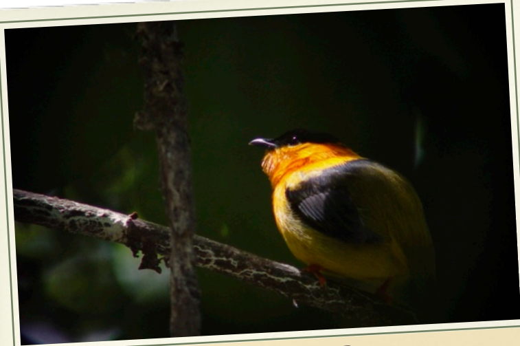
CARARA NT. PARK

Professionally Leading Worldwide Birders