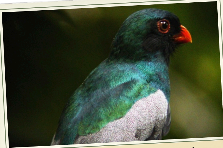
TENORIO RAINFOREST PAL!

Professionally Leading Worldwide Birders