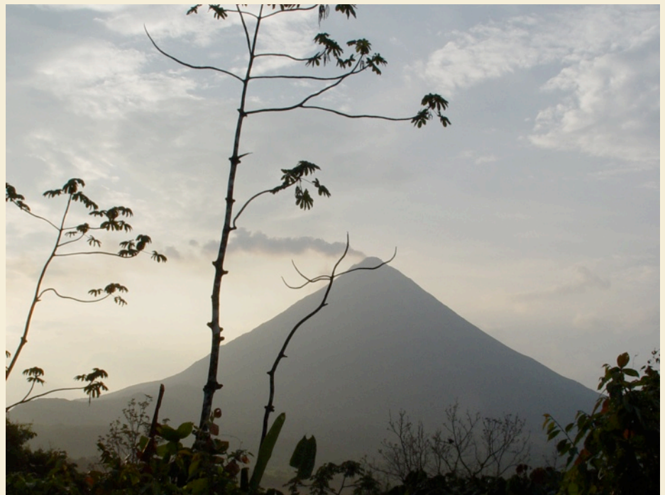
This trip is design to cover Paramo Forest, Lower Mountain Forest, Caribbean Rainforests, Caribbean Cloud Forest, and Pacific Lowland Forests.