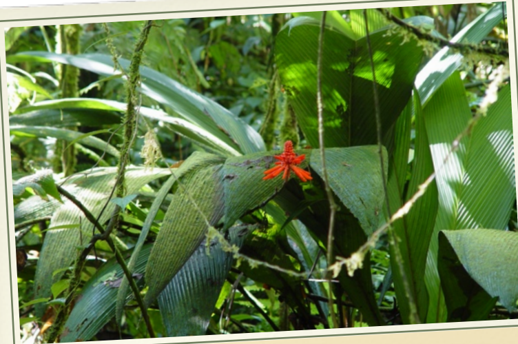
BRAULIO CARRILLO NT. PARK

Professionally Leading Worldwide Birders